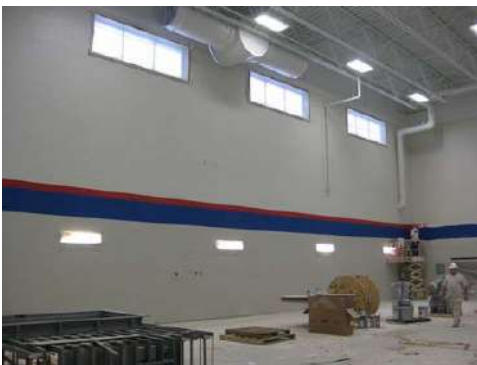
Area - H - Gym East Wall