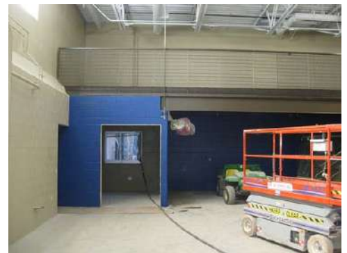
Area - A - Wood Shop West Wall