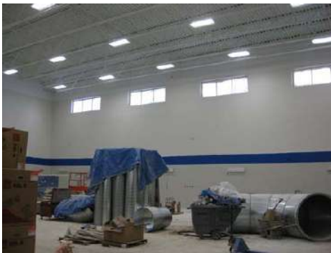
Area - H - Gym West Wall

The new gymnasium and locker room addition (Area – H) continue to progress. The interior painting of the new gym will be completed shortly. Light fixtures have been installed and the acoustical wall panels will be in place soon. The installation of the wood gym floor is tentatively scheduled to start the week of March 5 th . In the locker rooms the ceramic wall tile has been installed in the shower stalls and painting will be starting soon. On the exterior, the metal wall panels are starting to be installed. Area – H is on schedule for a May 1 st substantial completion date.