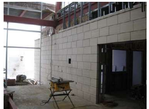
Area - D - Vestibule West Wall