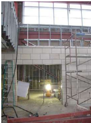
Area - D - Vestibule East Wall